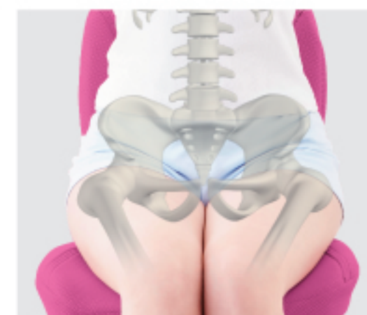
Support for buttocks